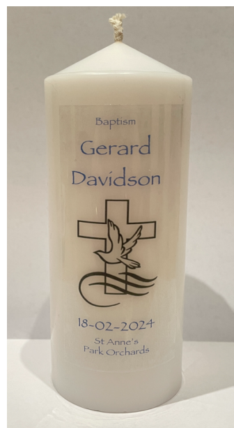
Example of Personalisation Colours can be requested.

CHOOSE BAPTISM SYMBOL FOR YOUR CLEAR LABEL